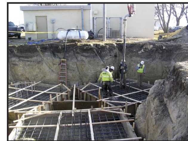
Workers pour concrete in the foundation for the cell phone tower site located in Claremont.

Check out JVT's website: www.jamesvalley.com/cellservice.html for more pictures and updates.