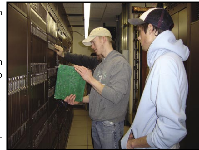
Students at MTI get lots of hands-on experiences including work with a variety of equipment.

Numerous scholarships are available to telecom technologies students, including the SDATC Memorial Scholarship. For scholarship information, contact SDATC by calling 605-224-7629.